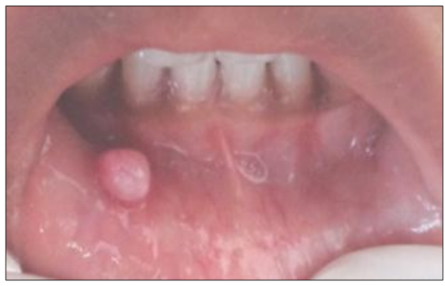
Figure 1: Soft tissue growth

The line of treatment was explained to the parents, and an